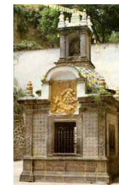
San Miguel del Milagro