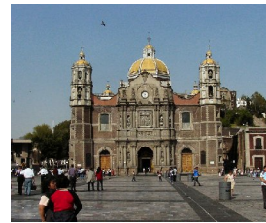
Basilica de Guadalupe