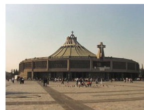
Basilica de Guadalupe